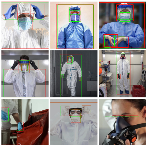
FIGURE 3. Some instances of MPPE detection (Green box is the ground truth and red box for detection).

Our approach achieves the most optimum mAP of 90.93%, outperforming all the previous works on MPPE detection discussed above. The higher mAP values of our approach indicate that our proposed approach is more effective in identifying and localizing MPPE objects in images.